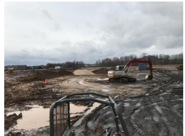
North End of Vehicle Storage/Vehicle Wash Buried Grit Interceptor