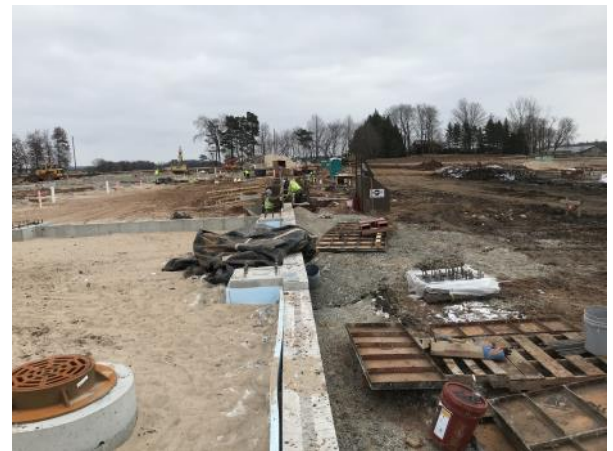
South Foundation Wall at Repair Garage and Administration