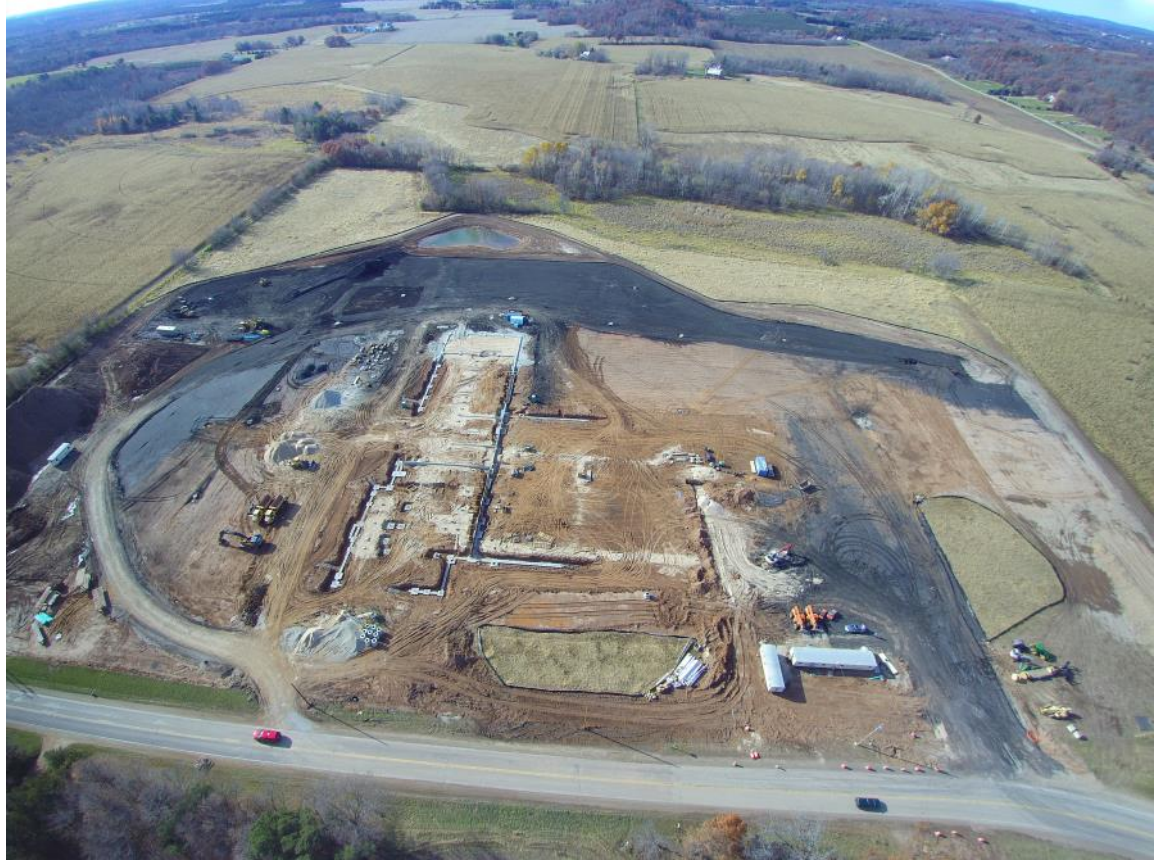
Aerial View from County A