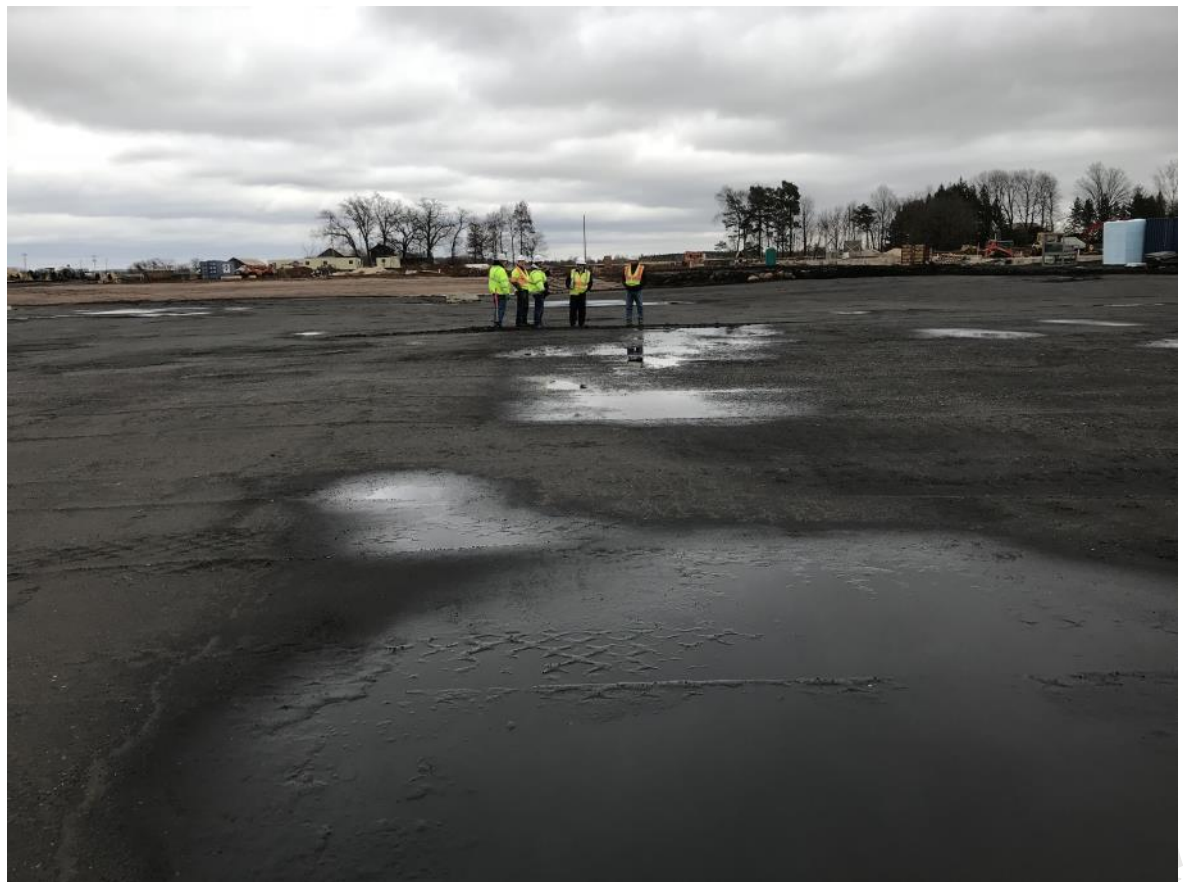
Cold Storage Building Pad

Site preparation continues and is being prepared for winter weather.