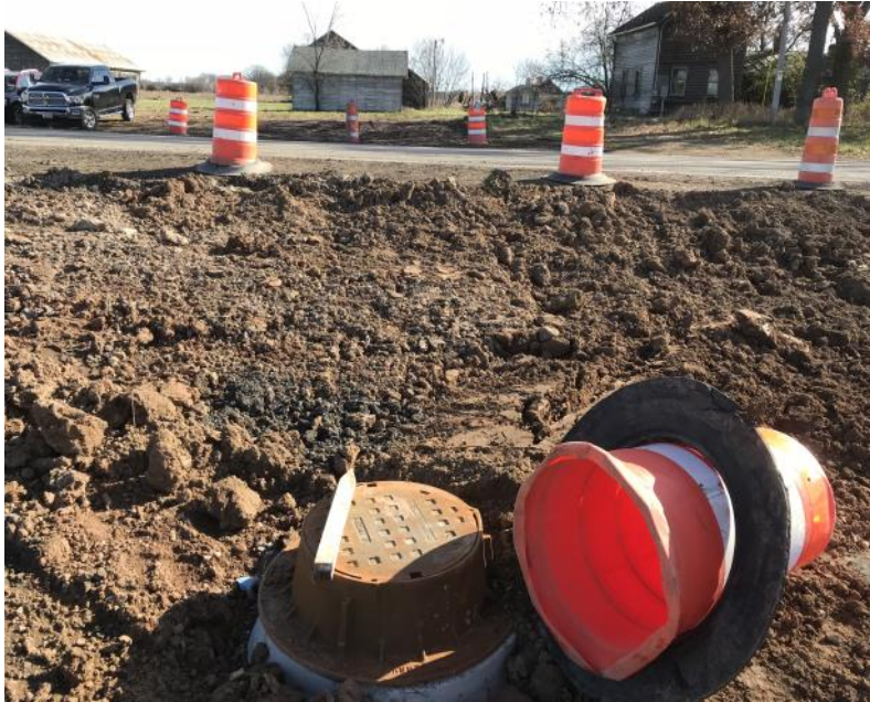
Sanitary Sewer below County A

Waupaca County has placed reclaimed sand at Cold Storage Building footprint. Detention pond on west site is dug.