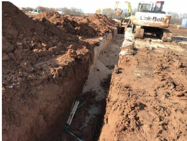
Unit C—Vehicle Storage Sanitary Plumbing Lines