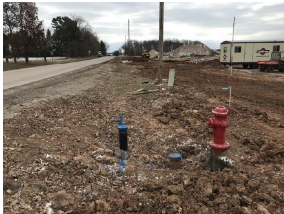
Water Line going South along County A