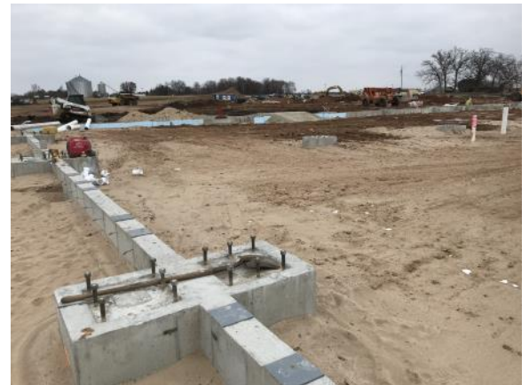
Area A & Area B Interior Foundations