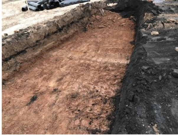
Sand Storage Shed Excavations